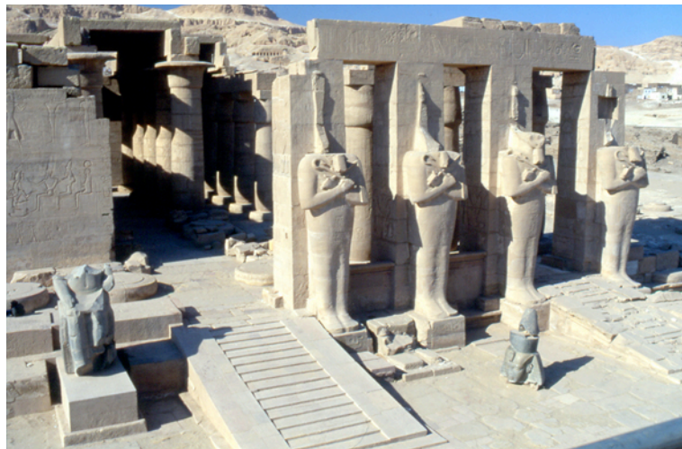
View of the hypostyle hall from the second courtyard

The lower part of the second statue was put back into place. Its upper part was that which Belzoni had shipped away and which is today housed in the British Museum.