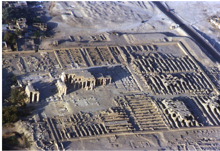
Aerial view of the Ramesseum

At the time of Ramesses II this temple was called "the Mansion of Millions of Years of Wsr-M3't-R' Stp-n-R' " 7 (one of Ramesses' names) which United with Thebes ( Waset ) in the Domain of Amun." Amun was the god who presided over the destinies of the Egyptian empire and who resided in the monumental temple on the east bank, in Karnak and in Luxor.